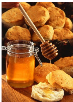
Honey has been used for centuries to treat wounds

Our objective is to create natural products using our bee produced ingredients